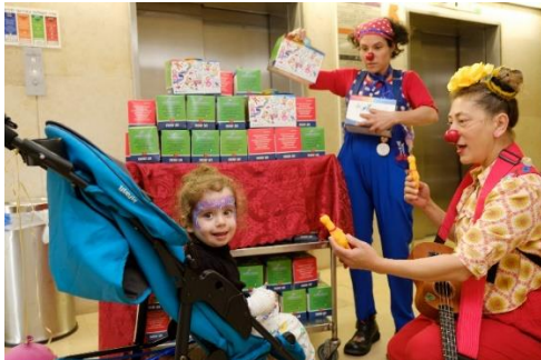
Clowns at Hadassah delivering joy and mishloach manot