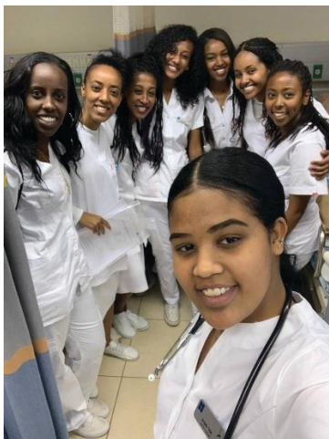
A group of trainee-Ethiopian-Israeli nurses in the program

Achotenu (“our nurse, our sister”), piloted in 2016 and providing nursing scholarships for young Ethiopian-Israelis.