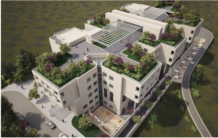
Architect's vision of the new Rehabilitation Center at Mt Scopus