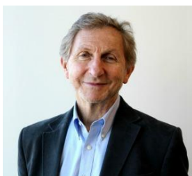
Prof Frank Oberklaid, founder of Goshen

The Goshen initiative for improving child healthcare in Israel was developed in 2015, with a recognition that paediatrics in Israel is not equipped to address children’s health and wellbeing in a holistic way. The fragmented healthcare system and paediatricians are relatively ill-equipped to deal with common problems such as attention deficit disorders, developmental delays or frequent behavioural issues – and more serious problems like autism spectrum disorders.