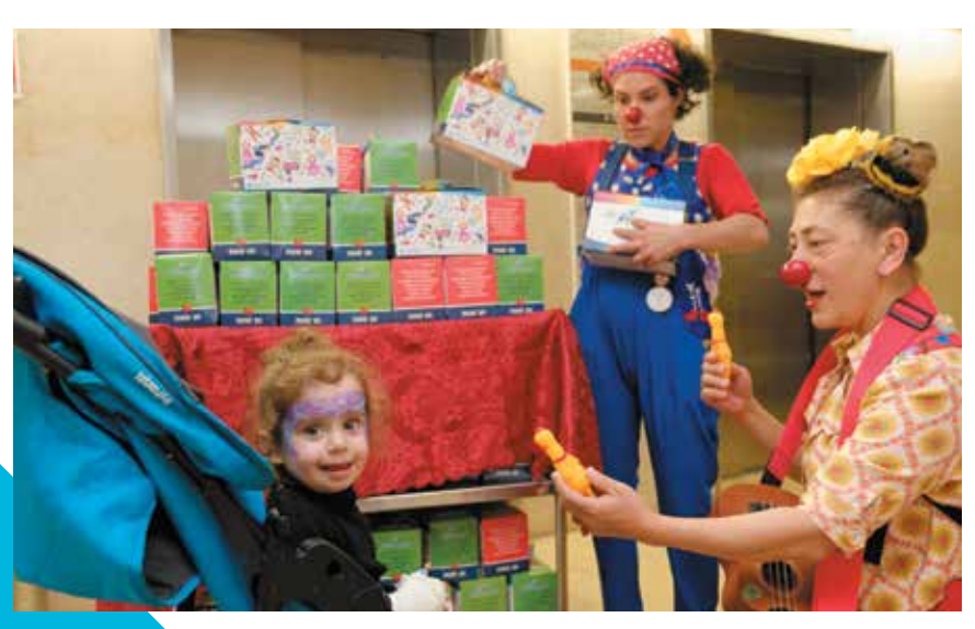
Clowns at Hadassah delivering joy and mishloach manot